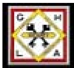
GHLA HOUSTON, TX

TUESDAY, JUNE 23rd, 2009 MARKS I-QWIK CERTIFICATION 3 HR. CEU CREDITS 5:30PM-8:30PM - $25.00 STUDENT